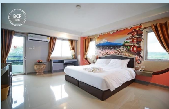
One Bedroom (Single)